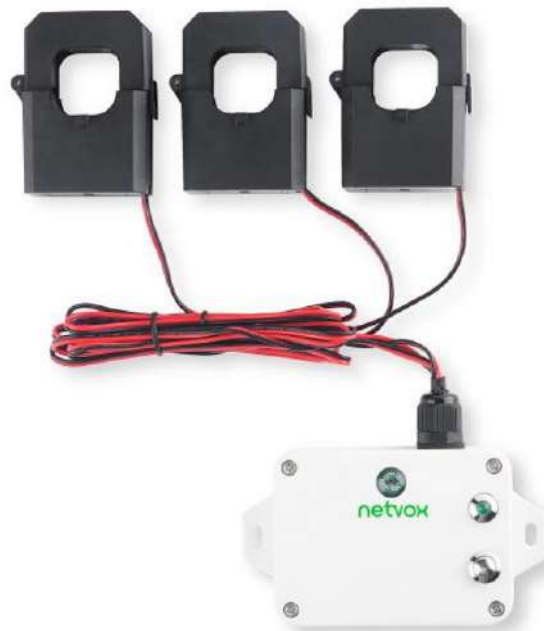
Figure1 R718NL325 Appearance

Wireless Sensor Network Based on LoRa Technology